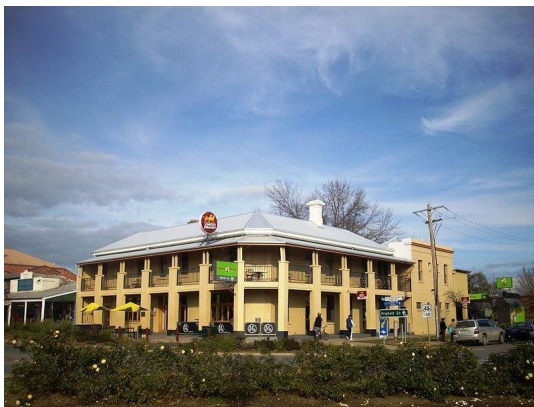
The Mansfield Hotel Where a fire started in the kitchen.