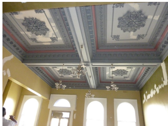
Example of heritage project with interior decorative finishes using “passive fire protection coatings”